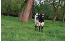
585 MIDNIGHT SKY